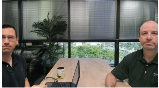
Logitech BRIO Webcam (90-degree FOV)