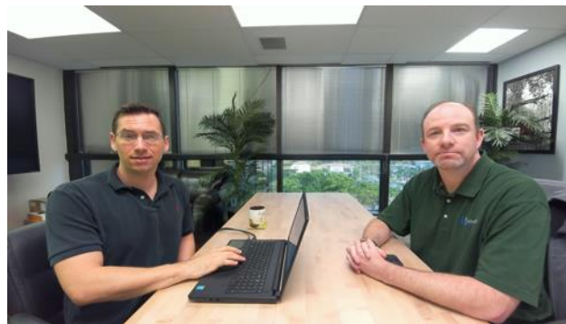
Logitech MeetUp ConferenceCam (120-degree FOV)

In the three images above, the local participants are seated ~ 36 inches away from the camera. The only difference is the camera in use to capture the local participants. While all three cameras are providing a high-quality experience, the above highlights the importance of a camera's field-of-view when used in small meeting spaces.