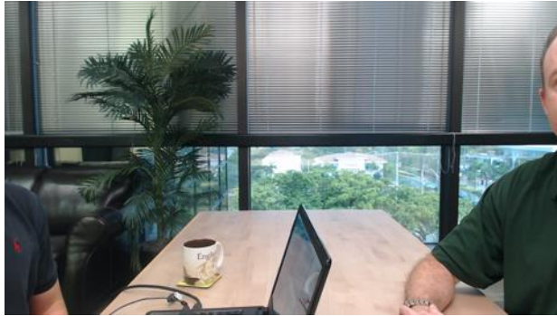
Logitech C920 Webcam (78-degree FOV)

Participant Capture - MeetUp's 120-degree horizontal field-of-view camera successfully captured all local meeting room participants, including those seated only a few feet from the display as would be the case in small / huddle rooms.