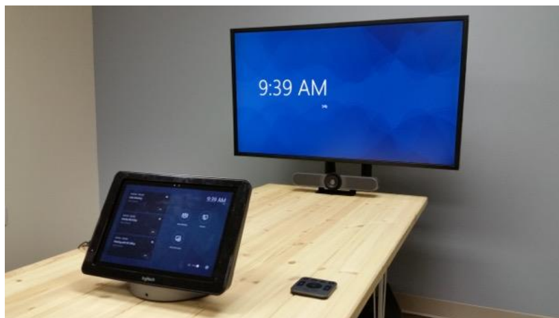
Skype for Business huddle room including Logitech MeetUp connected to Skype Room System (Surface Pro 4 tablet installed in a Logitech SmartDock)

Full Duplex Support – MeetUp passed our full duplex audio test (near and far-end participants speaking and hearing each other at the same time) without issue.